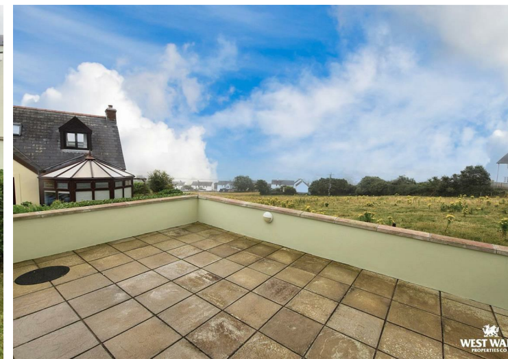
**Adjacent building plot available at separate negotiation**